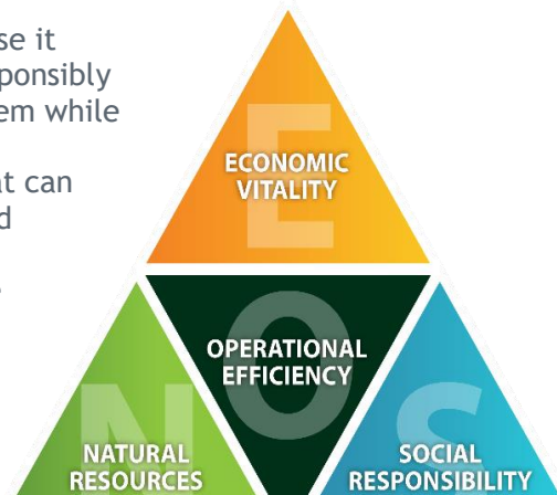
Figure 1.1 EONS Elements of Sustainability (Sustainable Aviation Guidance Alliance, SAGA)

Traditional business decision-making often uses budgetary or financial considerations as its basis, while neglecting or de-prioritizing other elements that do not have a simple dollar value. Applying the framework of sustainability allows for decision-makers to proactively plan for issues like reducing energy consumption or maintaining good community relations rather than just reacting to issues as they arise. It ensures that these traditionally non-core business issues are considered earlier, if appropriate, and are weighed alongside conventional business ideas. Airport sustainability as part of a business strategy can have many benefits, such as an improved user experience, reduced operational costs, reduced environmental footprints, improved community relations, growth in the regional economy, or opportunities to use new technologies.