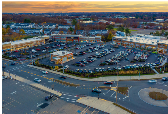
North Shore Crossing