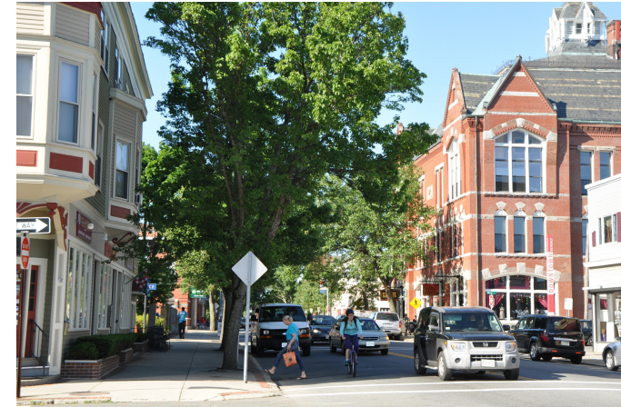
Cabot Street, Beverly